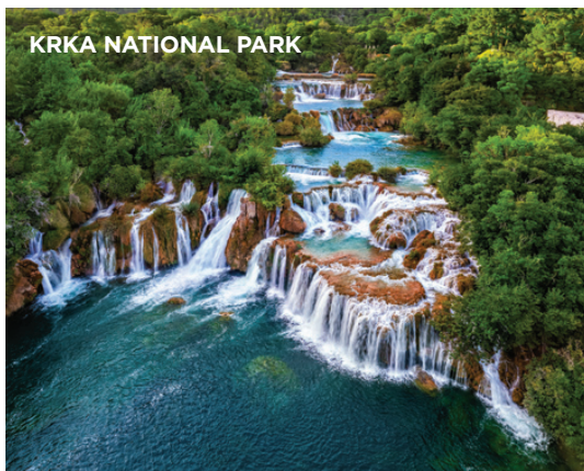
KRKA NATIONAL PARK