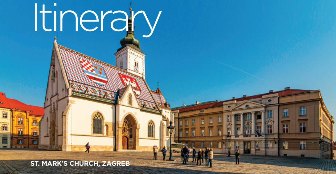
ST. MARK'S CHURCH, ZAGREB