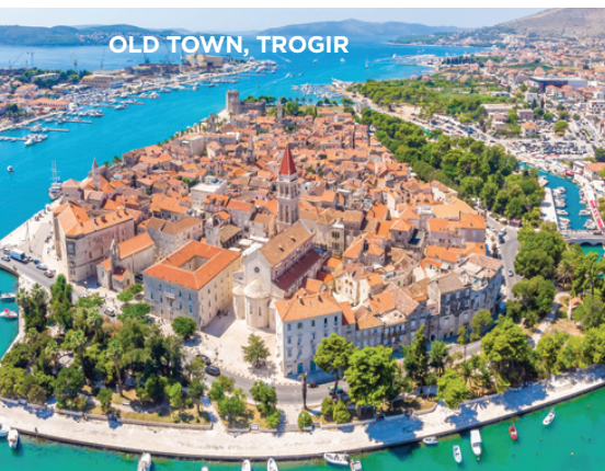
OLD TOWN, TROGIR