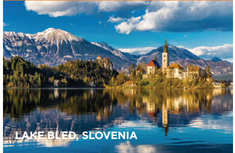
LAKE BLEED, SLOVENIA

(B) Breakfast / (L) Lunch / (D) Dinner / (R) Reception