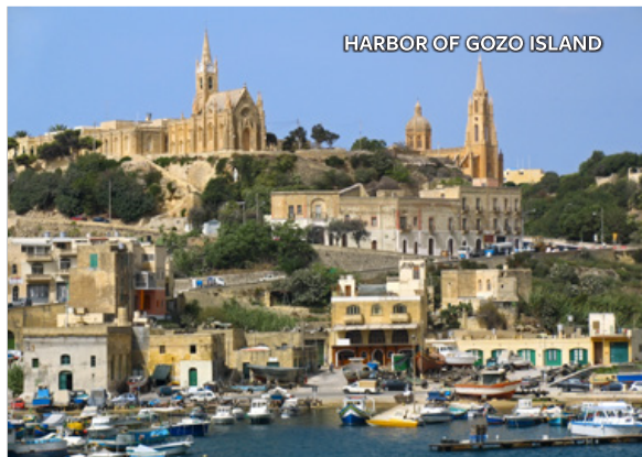
HARBOR OF GOZO ISLAND