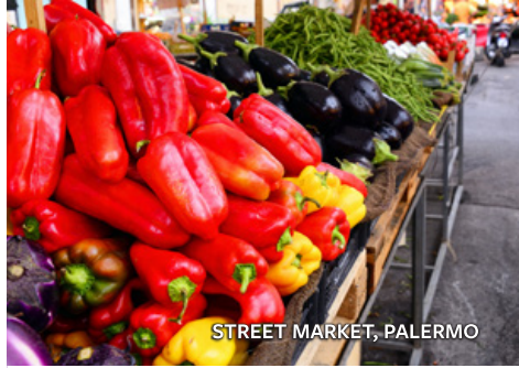
STREET MARKET, PALERMO