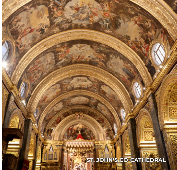
ST. JOHN'S CO-CATHEDRAL