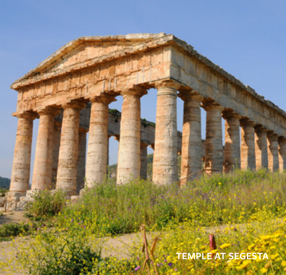
TEMPLE AT SEGESTA