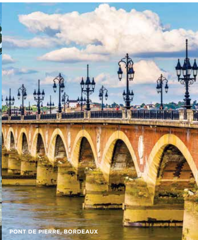
PONT DE PIERRE, BORDEAUX

site that possesses an extensive underground system of shafts, levels, and passageways. Aboard an electric train, travel more than a mile into the interior of the cave to see its artistic engravings or black contour drawings, which consist of 224 animals, primarily mammoths, and four human figures. In the afternoon, enjoy a private visit to a truffle farm in Saint-Cyprien, accompanying the owner and his dog in search of the precious fungus, and a vineyard visit with a tour of the cellar and a wine tasting.