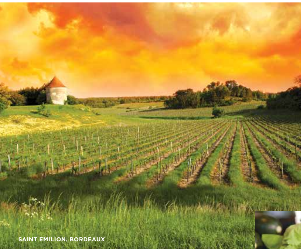
SAINT EMILION, BORDEAUX