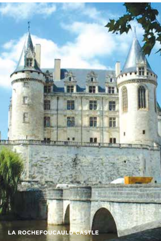
LA ROCHEFOUCAULD CASTLE