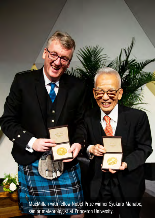
MacMillan with fellow Nobel Prize winner Syukuro Manabe, senior meteorologist at Princeton University.