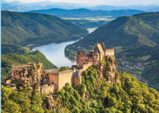
Cruise along the Danube River through the stunning natural beauty of the Wachau Valley landscape, a UNESCO World Heritage site.