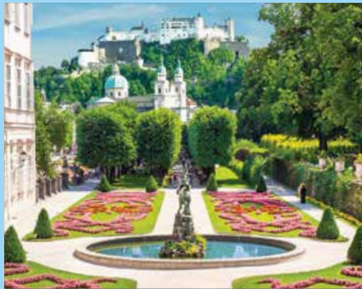
Stroll through the Baroque pleasure gardens of Mirabell Palace in the heart of Salzburg.

After lunch on board the ship, visit the UNESCO World Heritage-designated