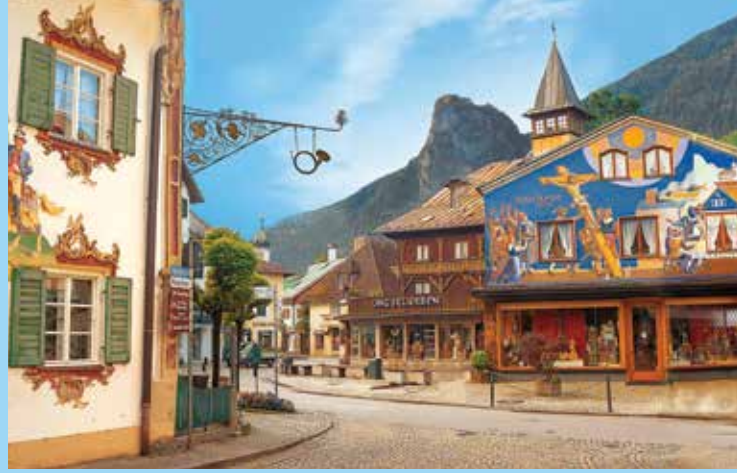
Enjoy the charm of Oberammergau, with painted trompe l'oeil frescoes on many homes and shops, depicting fairy tales and religious scenes.