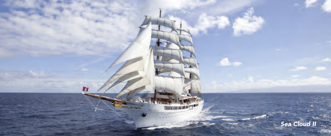
Sea Cloud II

To secure your reservation, please call Arrangements Abroad at 212-514-8921 or 800-221-1944, fax: 212-344-7493; or complete this form and return it with your deposit of $1,000 per person ( fully refundable until 120 days prior to departure ), to be paid by debit card, credit card, wire transfer, or check payable to Arrangements Abroad. Mail to: Arrangements Abroad, 260 West 39th Street, Suite 1701, New York, NY 10018-4424.