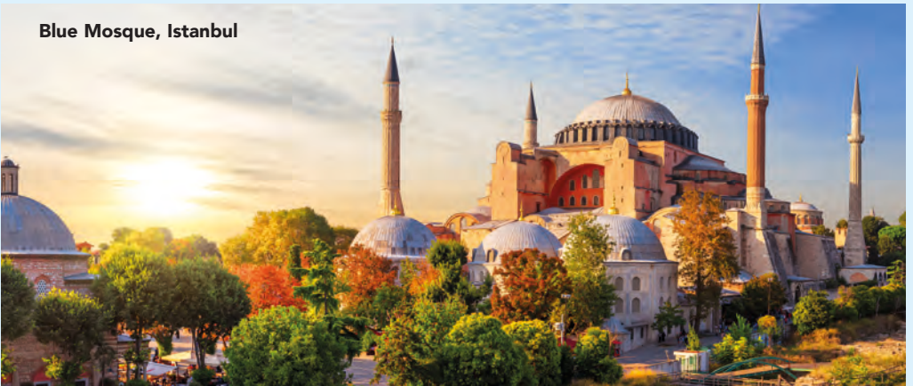
Blue Mosque, Istanbul

INCLUDES: Two nights at the Hotel Grande Bretagne in Athens, with two breakfasts, two lunches, two receptions, and two dinners. Sightseeing as noted.