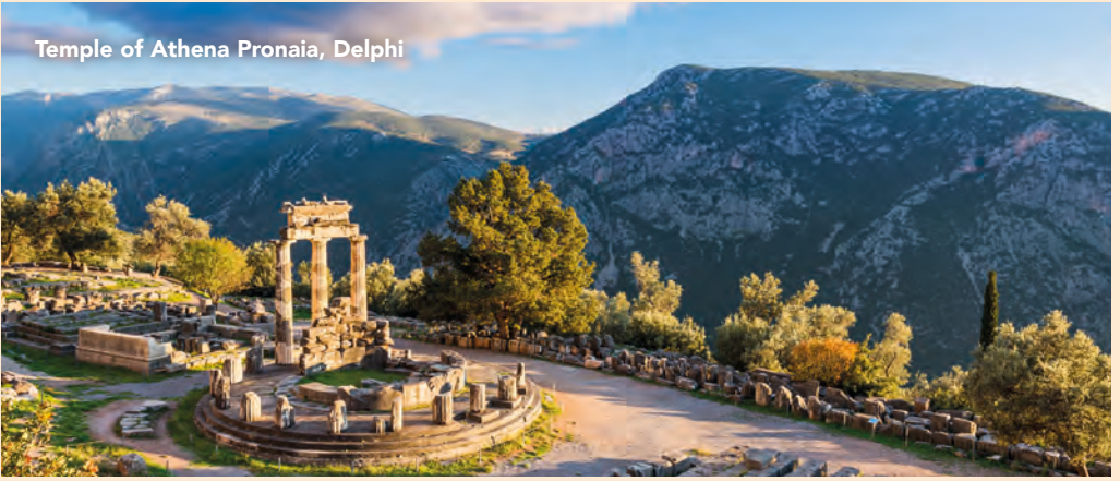
Temple of Athena Pronaia, Delphi