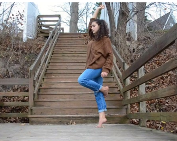
Photos from top: Nassau Hall, lit orange for Commencement 2021; remote learning; Chemistry laboratory kit; remote student dance project for “Princeton Dance Festival Reimagined.”