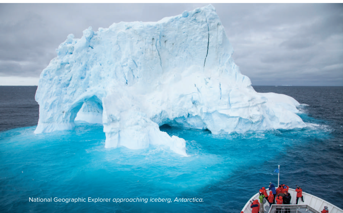
National Geographic Explorer approaching iceberg, Antarctica.

14 DAYS/11 NIGHTS—ABOARD NATIONAL GEOGRAPHIC EXPLORER