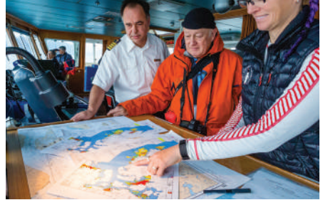
Guests review nautical maps at the Bridge.

National Geographic Explorer is a genuine expedition ship, not a cruise ship masquerading as one. Therefore, she is uniquely equipped to facilitate the expedition philosophy of in-depth seeing and experiencing—with state-of-the-art tools for exploration. An unparalleled base for discovery, the ship enables the fullest expression of the expedition style: an intimate, authentic, learning-oriented environment. She is also most importantly able to provide excellent safety features and an equally excellent Antarctic experience. In addition to being an ice-class polar expedition vessel, National Geographic Explorer is a beautiful ship, built with careful attention to details and comfort. Accommodating just 148 guests in 81 outside-facing cabins, she fosters a welcoming esprit de corps within the expedition community and provides a perfect ending to active days.