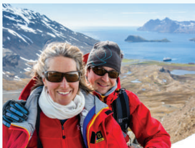
Guests enjoying the view on a hike.

Go with us for a genuinely immersive experience. National Geographic Explorer's Antarctic itinerary is crafted by explorers, enhanced by onboard experts and advanced tools, and features myriad opportunities for adventure. Begin each day with a morning stretch class or pre-breakfast coffee. Hang out on the Bridge to watch the Captain navigate