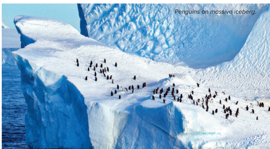
Penguins on massive iceberg.

Adélies. Chinstraps. Gentoos. These are the riveting, often raucous, denizens of Antarctica. Meet and greet three of the world's penguin species. Visit their rookeries and see fascinating behavior. Whether they're squabbling, fetching krill and feeding chicks, or “porpoising” (propelling themselves from the sea), you will delight in their antics and marvel at their adaptation to life on the ice.