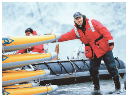
The expedition staff helps guests board kayaks safely and swiftly.

You'll travel with the top team plying polar waters. The ship's Captain and officers have decades of experience navigating Antarctic expeditions, confirming they have the expertise and confidence to safely conduct guests through the full range of polar weather and sea conditions. With a profound love for the polar geographies, the Captain and his team ensure that spontaneity and memorable moments remain expedition hallmarks.