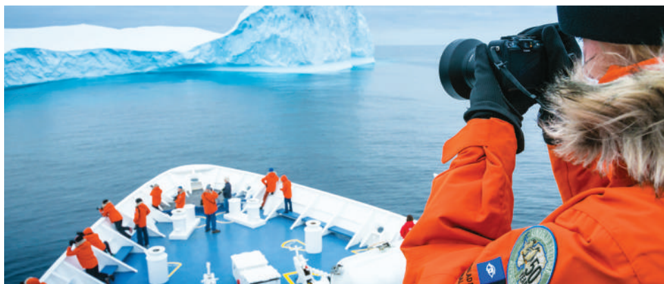
Guests photograph an iceberg in the Drake Passage.

Unique in the world of travel, our expedition photography program offers guests of every skill and interest level unrivaled photography opportunities—including a top world-class professional photographer aboard. Plus, a certified photo instructor is on hand to help you understand your camera settings, the basics of composition, and wildlife behavior. Then, test the latest high-end photo gear, on loan from B&H Photo Video. Now, every guest—from smartphone camera users to semi-pro shooters—can stand side-by-side with top photographers and pick up tips in the field and take great photos.