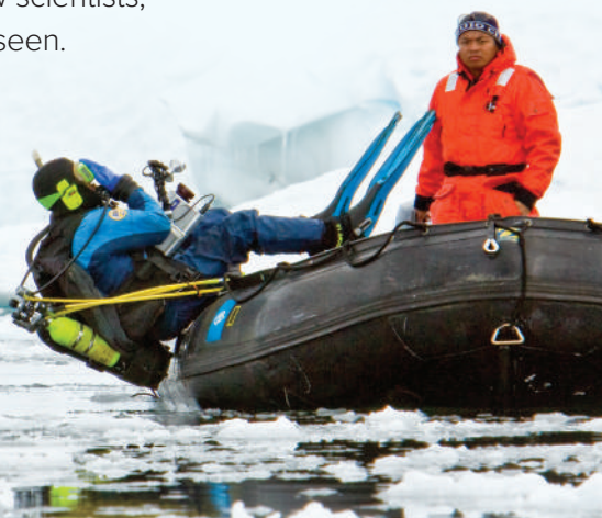
Undersea specialist dives with a video camera to shoot footage for viewing in the lounge.

An onboard undersea specialist will dive with a video camera and bring back footage for all to watch in vivid HD, in the dry warmth and comfort of the ship's lounge, perhaps with a cocktail in hand and hors d'oeuvres at the ready. Always interesting, it can also be pioneering. In Antarctica, the footage you see may be of marine life few scientists, or human eyes for that matter, have ever seen.