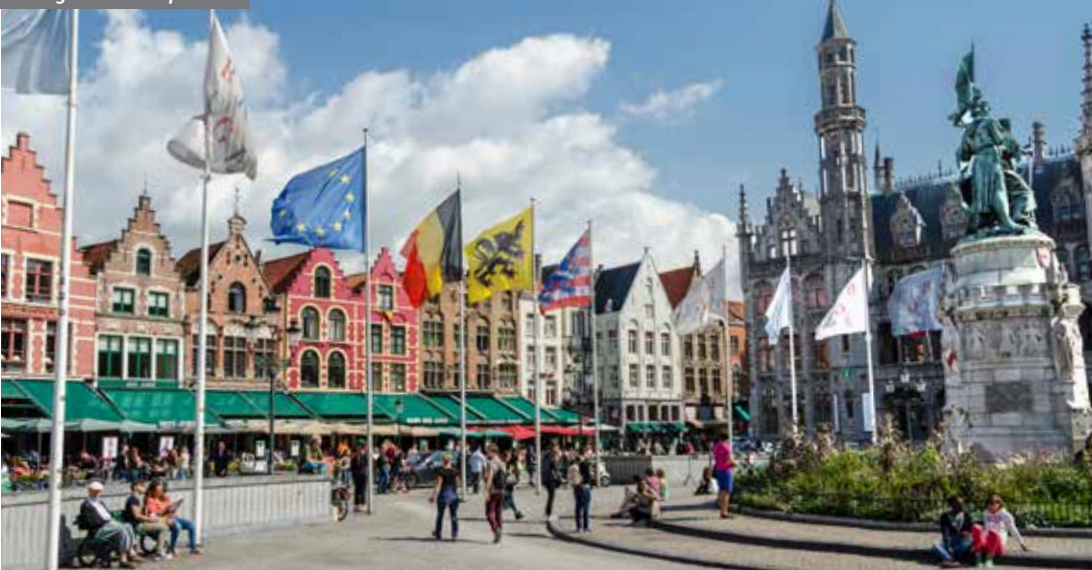
Bruges market square

Following breakfast, disembark and continue on the Hague Post-Program Option or transfer to the airport for your return flight home. (B)