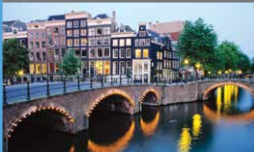
Amsterdam's canals along arched bridges