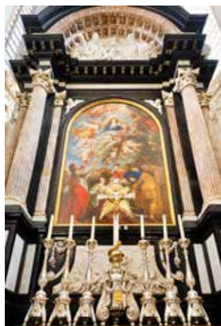
The Assumption of the Virgin Mary, painting by Rubens in the Cathedral of Our Lady

Explore the enchanting Old Town of Antwerp, which preserves its