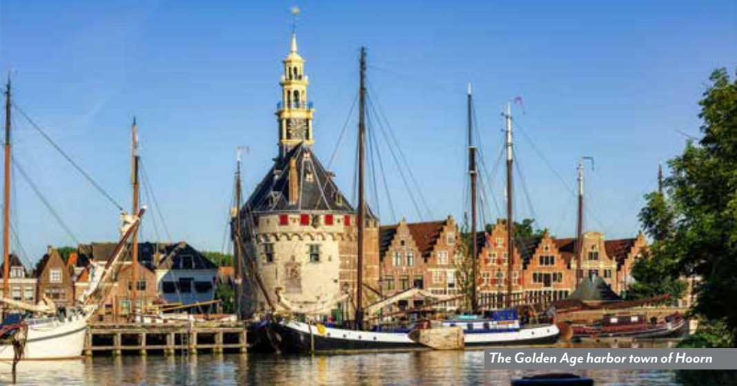
The Golden Age harbor town of Hoorn