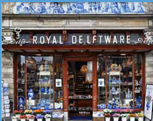
Shop in Delft