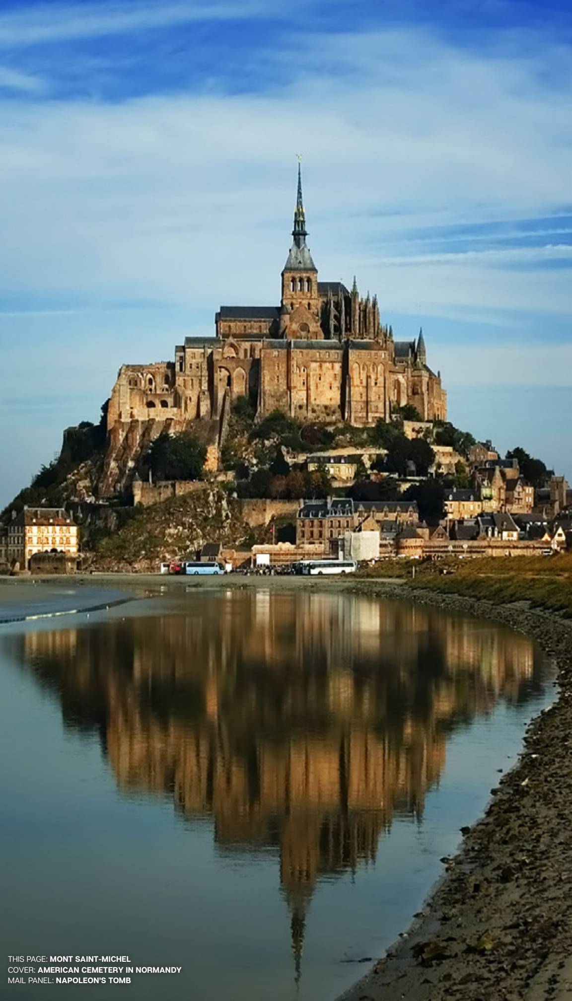
THIS PAGE: MONT SAINT-MICHEL COVER: AMERICAN CEMETERY IN NORMANDY MAIL PANEL: NAPOLEON'S TOMB