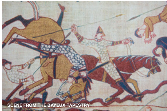
SCENE FROM THE BAYEUX TAPESTRY