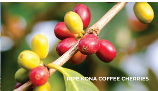
RIPE KONA COFFEE CHERRIES