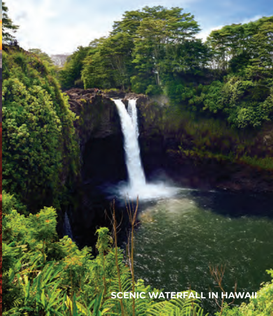
SCENIC WATERFALL IN HAWAII