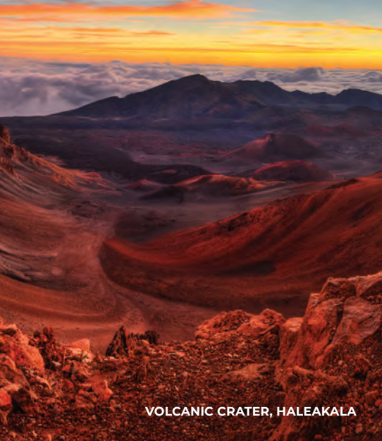
VOLCANIC CRATER, HALEAKALA