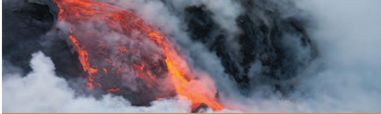
COVER Sunset in Hawaii ; REGISTRATION FORM Lava flow in Hawaii ; Pu'uuhonua o Honaunau National Historical Park ; Plumeria ; Green Sea Turtle ; Observatories on Haleakala ; Volcanic Crater, Haleakala ; Scenic Waterfall in Hawaii ; Kona Coast ; Dolphins ; Halemaumau Crater ; Steaming Bluff ; Ripe Kona Coffee Cherries

California Seller of Travel Program CST #2088800-40