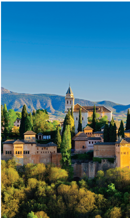
The hilltop Alhambra palace and fortress in Granada