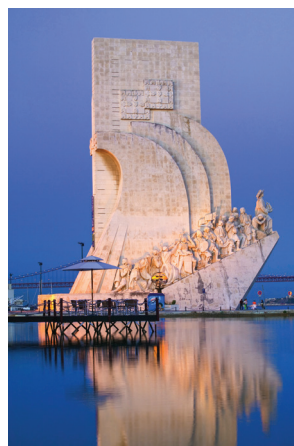
Lisbon's Monument to the Discoveries

Day 13: Madrid Our morning tour of this monumental and dignified capital city includes vast