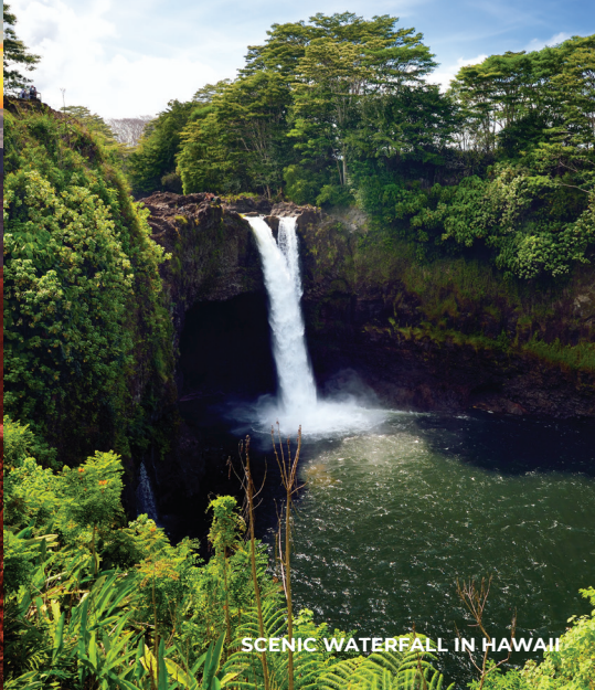
SCENIC WATERFALL IN HAWAII