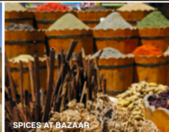
SPICES AT BAZAAR