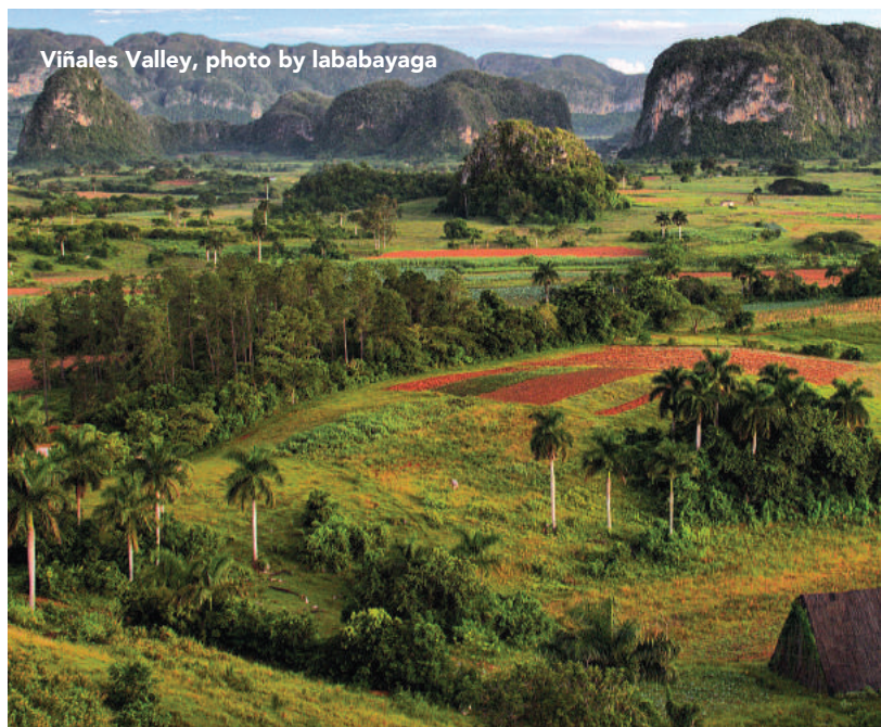
Viñales Valley

Join a local architectural historian for a lecture on the history of Havana's remarkably well-preserved buildings. Then take a walking tour of Old Havana focusing on the four main squares: the Plaza de Armas, Plaza de San Francisco de Asís, Plaza Vieja, and Plaza de la Catedral. Following lunch at a paladar , take a private tour of the splendidly renovated Gran Teatro de La Habana Alicia Alonso, home to the Cuban National Ballet. Later, explore the homes and studios of some of Havana's leading artists, where there may be an opportunity to purchase paintings and drawings. Dinner is at El Cocinero, followed by an evening of entertainment next door at Fábrica de Arte Cubano (FAC), the city's vibrant multidisciplinary performing and visual arts space. B,L,D