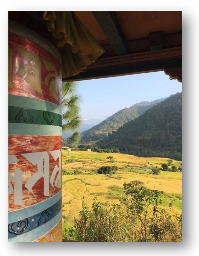
Tour Cost: $9,990 Single Supplement: $2,900 (subject to availability)

1940s photographs of the site. She has taught courses on portraiture and the Silk Road and is developing an art history course on sacred sites in Asia. She has served as a Study Leader on Princeton Journeys trips to China, Japan, Vietnam and Cambodia, and is eager to introducetravelers to the traditional "sacred sites" of Bhutan and their artistic equivalents throughout Asia.