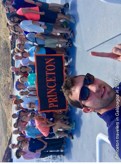
Princeton travelers in Galápagos in 2017.