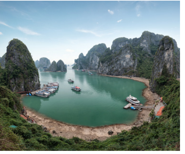
Ha Long Bay