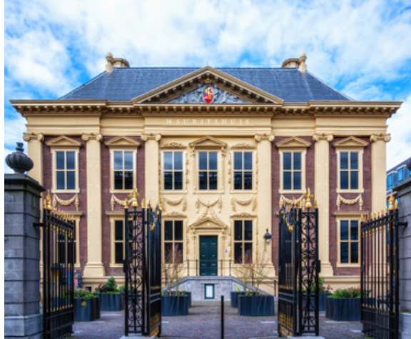
Mauritshuis Museum, Den Haag