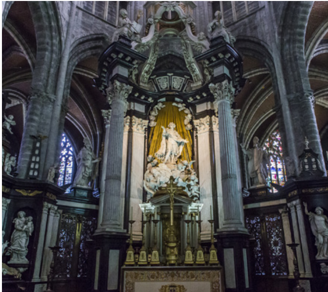
St. Bavo's Cathedral, Ghent