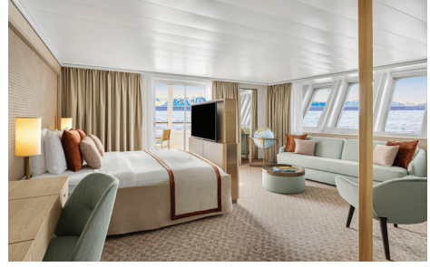
Newly renovated Category 7 suite with balcony.

All cabins and suites face outside with windows or portholes, and have a private bathroom and climate controls. Equipped with Wi-Fi, multiple electrical outlets, USB outlets, full-length mirror, and phones. TV featuring entertainment on demand, live feed from onboard presentations, bow camera, and ship's position. Luxury bed linens and pillows. Botanically inspired shampoo,