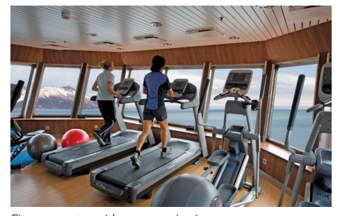
Fitness center with panoramic views.

The vessel is staffed by a wellness specialist and features a glass-enclosed fitness center, outdoor stretching area, LEXspa treatment room, and sauna.