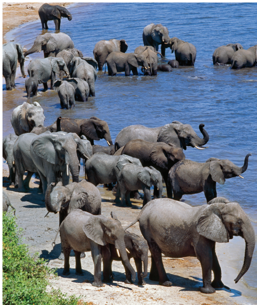
Elephants abound at Chobe

Day 13: South Luangwa National Park/Lusaka/ Depart for U.S. We travel by charter flight today