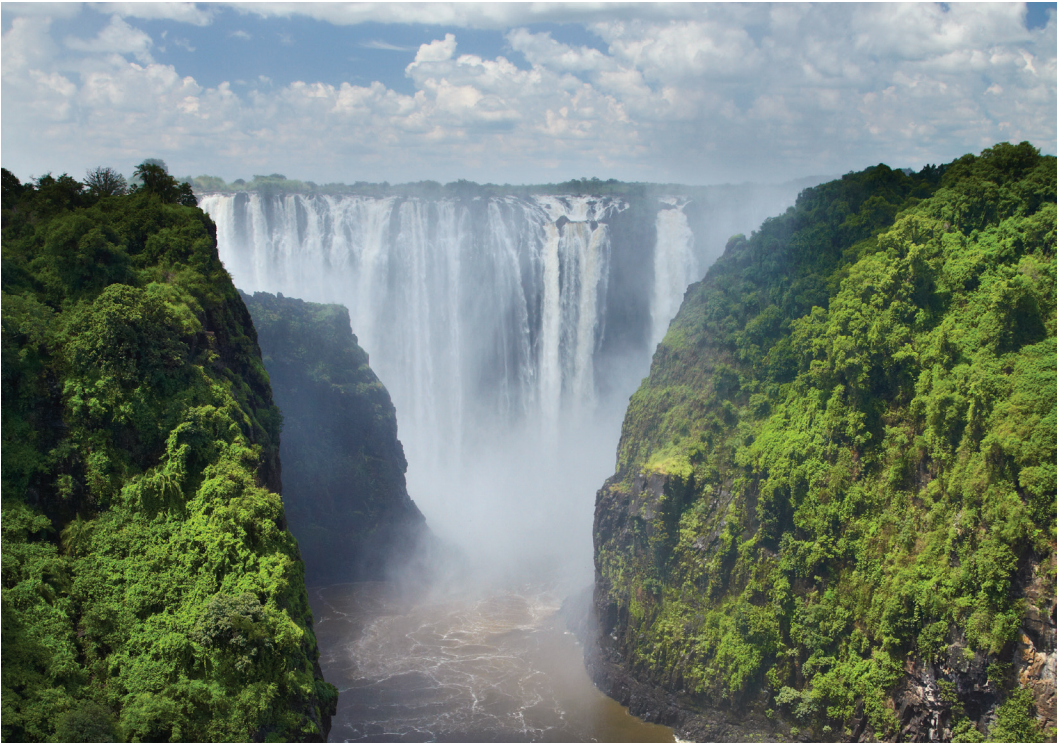
Known as the “Smoke that Thunders,” Victoria Falls is one of the wonders of the natural world.

River, where we may see hippo, crocs, and some of the park’s 450 species of birds (including the sacred ibis, carmine bee-eaters, fish eagles, and kingfishers). We dine tonight at our lodge. B,L,D