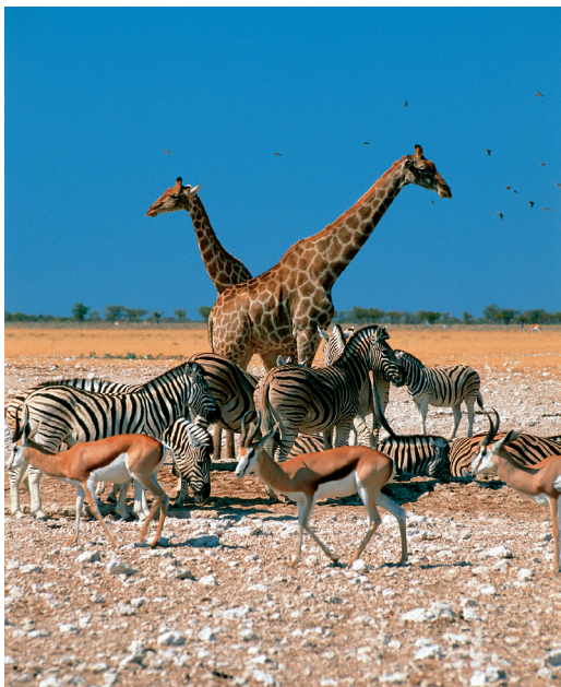
A variety of fauna spotted during a game drive

to Lusaka, Zambia’s capital, where we have hotel day rooms until our departure this evening for the airport and our overnight flight to the U.S. B