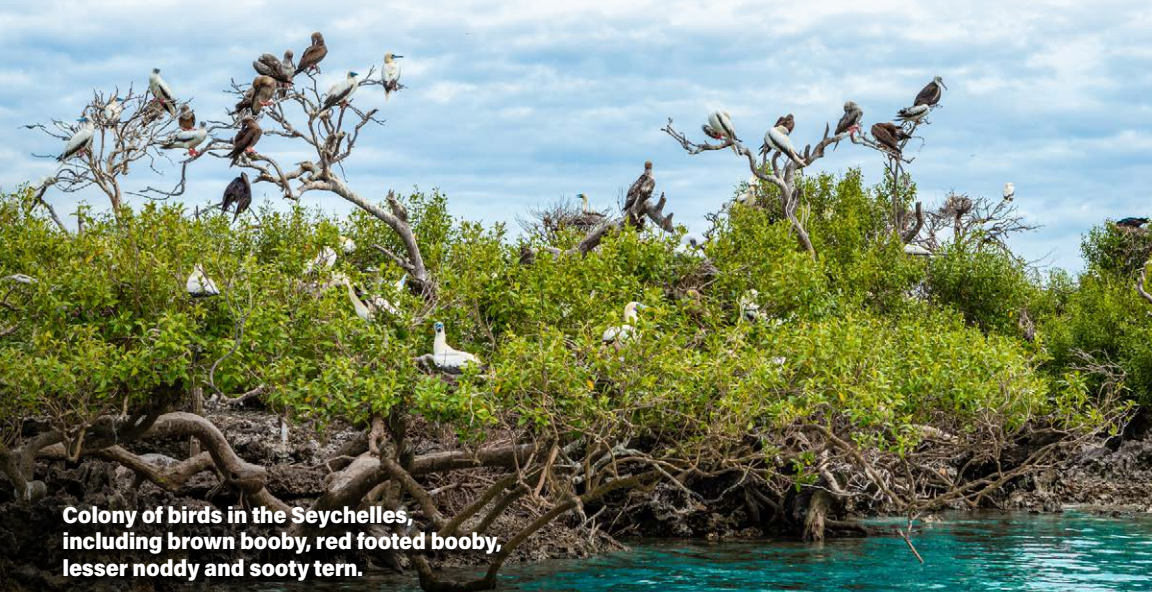
Colony of birds in the Seychelles, including brown booby, red footed booby, lesser noddy and sooty tern.