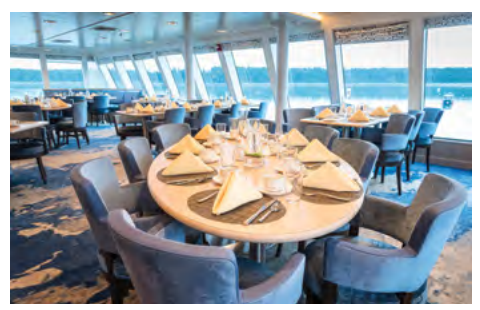
The casual dining room with its expansive windows.

Served in single seatings with unassigned tables for an informal atmosphere. Cuisine is fresh, sustainable, accented with regional flair and served plated.