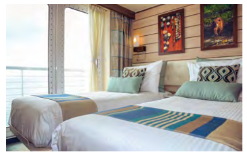
Category 4 cabin with single beds (which can be converted to a queen) and a private step-out balcony.