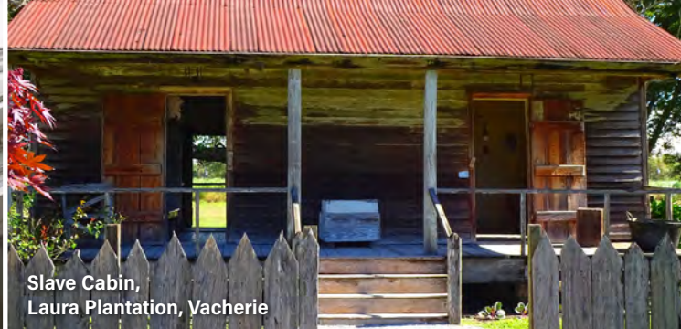
Slave Cabin, Laura Plantation, Vacherie