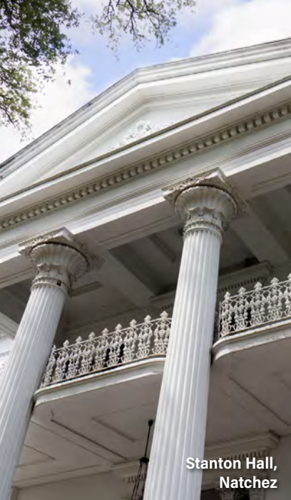
Stanton Hall, Natchez