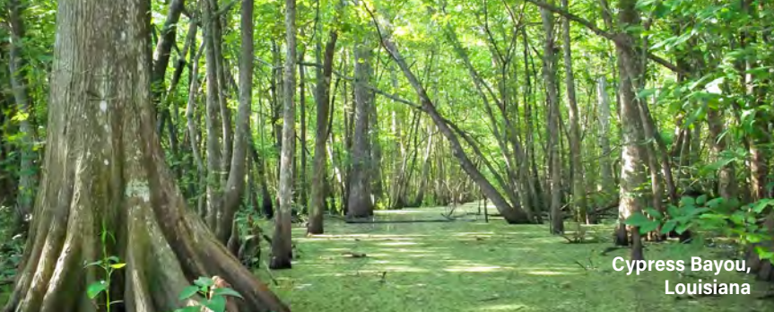
Cypress Bayou, Louisiana