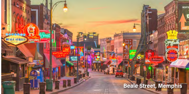
Beale Street, Memphis