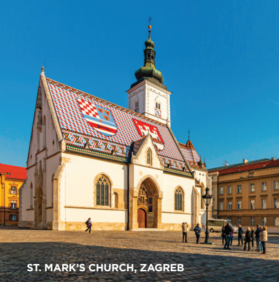
ST. MARK'S CHURCH, ZAGREB