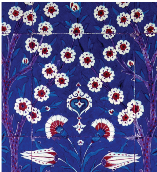
Exquisite Iznik tiles

Day 14: Antalya/Perge This morning we explore the ruins at Perge, an ancient Greek city once among the world’s prettiest and most prosperous. We also visit the Duden Waterfalls,