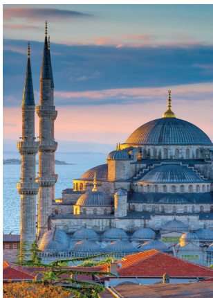
Istanbul’s majestic Blue Mosque

Day 13: Antalya We discover Antalya’s charming old city (Kaleici) on a morning walking tour through its narrow streets, past historic buildings, mosques, and parks. After lunch at a local restaurant, we visit