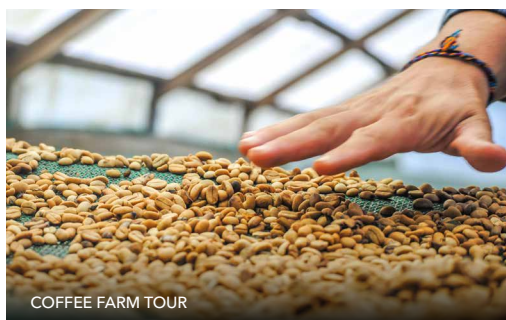
COFFEE FARM TOUR

This morning, see the rainforest canopy from above and below at Arenal Hanging Bridges. With 15 bridges ranging in length from 16 to 330 feet, the site straddles a variety of ecosystems and offers the opportunity to enter the upper canopy at an elevation of 1,900 feet. Next, stop at a family-run business to learn about the coffee and chocolate-making processes - and indulge in some of the country's most famous products. Arrive at the