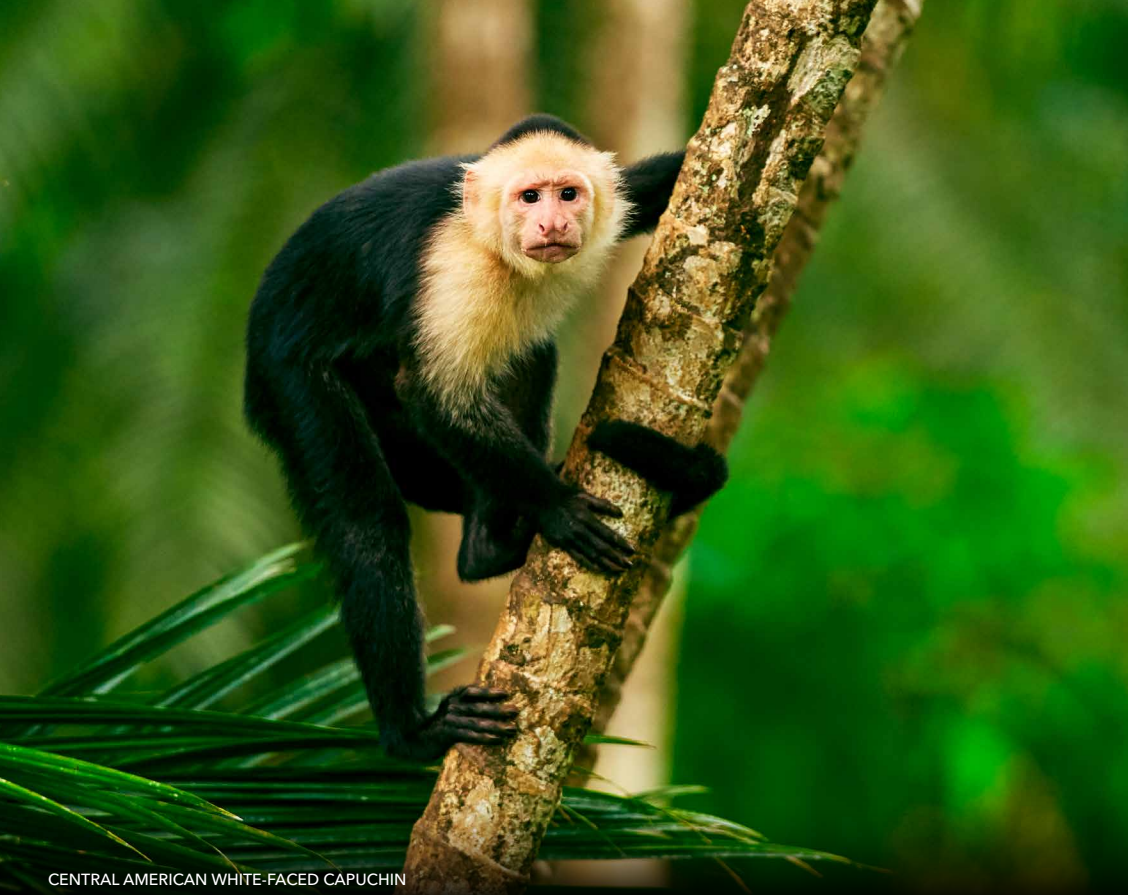
CENTRAL AMERICAN WHITE-FACED CAPUCHIN