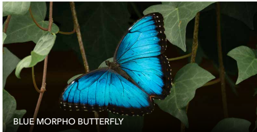
BLUE MORPHO BUTTERFLY

After breakfast, depart for the Organization for Tropical Studies La Selva Research Station, one of the world's leading institutions in tropical education and research. More than 240 scientific papers are published yearly from research conducted at the site. Be on the lookout for coati, collared peccary, mantled howler monkey, agouti, three-toed sloth, ornate hawk-eagle, crested guan, great tinamou, pied puffbird, and spectacled owl. After dinner, a nocturnal hike will provide a comparison between wildlife during the day and night. Overnight at Selva Verde Lodge. (BLD)