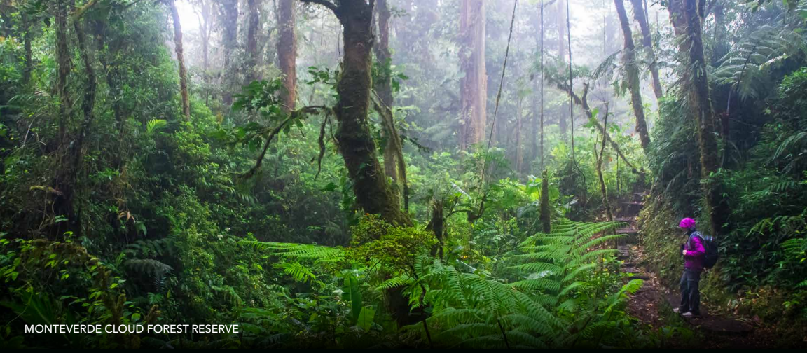
MONTEVERDE CLOUD FOREST RESERVE

WHY COSTA RICA? With one-fourth of its land mass under protection, Costa Rica encompasses 12 climatic zones along mountains, forests, ocean, and coast, and boasts nearly 4% of the world's biodiversity – despite spanning just 0.03% of the earth's surface.