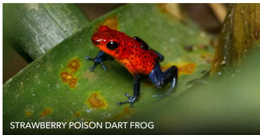
STRAWBERRY POISON DART FROG

Transfer back to the airport in San José for your flight home after 1 pm. (B)